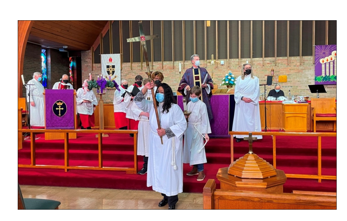
The service is over. Go in peace