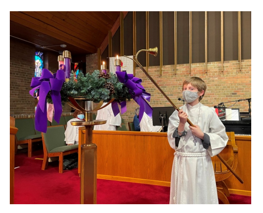
The lighting of the first and second Advent candles.