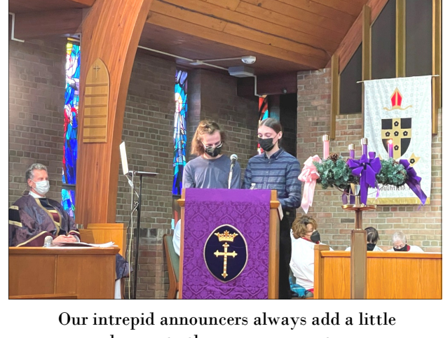
humor to the announcements.