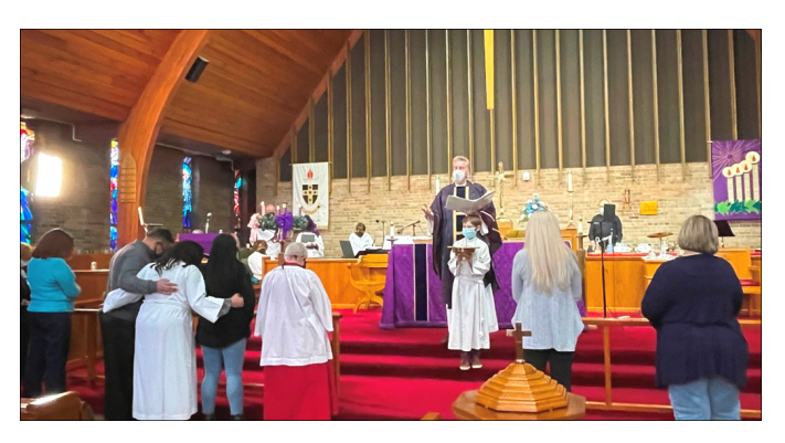
Life Celebrations Sunday brings congratulations for birthdays, anniversaries, and other happy events.