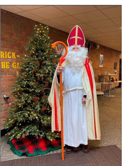
Look who came to visit today!